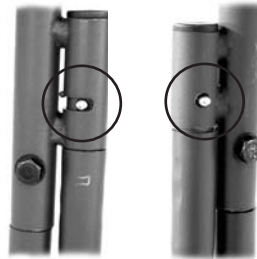
FIGURE 9 SPRING PUSH PINS ENGAGED