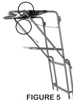
FIGURE 5 CABLES AND BRACES INSTALLED ON SEATING CHASSIS