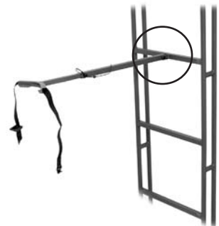
FIGURE 11 TREE STABILIZER BAR INSTALLED

STEP 3: Refer to Figure 1. Locate the two (2) 21 1/4" standing platform support cables (D.) and the 39 1/2" diagonal braces (E.). Install these onto the seating platform chassis (A.) as shown in Figure 4. NOTE: The 21 1/4" standing platform support cables go on the inside of the seating platform chassis (A.) as shown in Figure 4. Install the 39 1/2" diagonal braces (E.) using two (2) 3" x 5/16" bolts, two (2) nylon washers, four (4) washers and two (2) lock nuts. Repeat this STEP for the opposite side as shown in Figure 5.