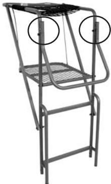
FIGURE 7 SWING-AWAY FOOTREST INSTALLED