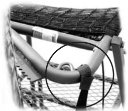
FIGURE 13 INSTALL CRISS-CROSS SAFETY STRAPS

STEP 6: Locate the previously installed criss-cross safety straps (J.). Cross the straps around the tree trunk and shown in Figure 14. Tie the ends of the criss-cross safety straps (J.) on the fourth ladder rung up from the bottom on the lower ladder section as shown in Figure 15. DO NOT tighten these straps yet.