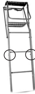
FIGURE 10 LADDER SECTIONS INSTALLED