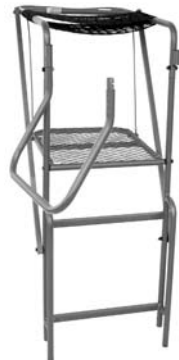
FIGURE 8 SWING-AWAY FOOTREST OPEN