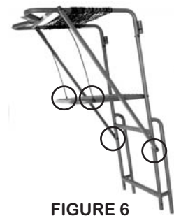
FIGURE 6 CABLES INSTALLED STANDING PLATFORM