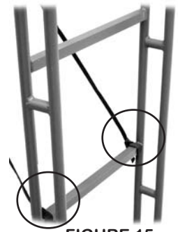
FIGURE 15 TIE SAFETY STRAPS ON LADDER

STEP 10: With the help of two (2) other adults at the base of the ladder stand holding it steady, climb to a height that allows you to safely attach your Scout, Inc. full-body fall arrest harness tether to the tree trunk as soon as possible. After your tether has been attached to the tree trunk securing your position, attach the ratchet strap to secure the top of the stand to the tree. To install the ratchet strap (K.), simply wrap the strap around the tree trunk and attach back to the welded receivers as shown in Figure 17. (Refer to Figure 12 for threading instructions). Make sure the ratchet strap (K.) is very tight. Once the ratchet strap (K.) has been installed, your treestand is now ready to use.