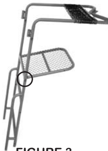
FIGURE 3 INSTALL STANDING PLATFORM