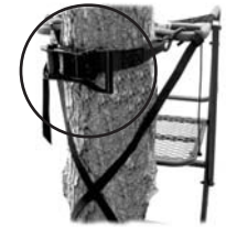
FIGURE 17 RATCHET INSTALLED