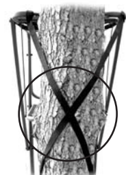
FIGURE 14 CRISS SAFETY STRAPS