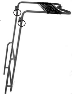
FIGURE 2 INSTALL SEATING PLATFORM ONTO UPPER LADDER

STEP 2: Refer to Figure 1. Locate the standing platform (C.). Install the standing platform (C.) onto the upper ladder section (B.) as shown in Figure 3. Bolt together using two (2) 1 3/4" x 5/16" bolts, two (2) washers, two (2) nylon washers and two (2) lock nuts.