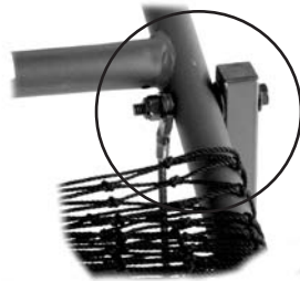
FIGURE 4 INSTALL SUPPORT CABLES AND BRACES