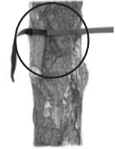
FIGURE 16 TREE BRACE IN- STALLED